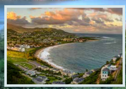
Coastal Communities, St. Kitts and Nevis

Many tuna species, barracuda, large grouper, king mackerel, swordfish, peto, Atlantic blue marlin