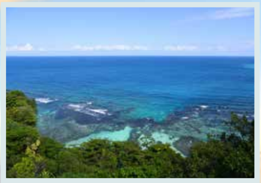
Coral Reefs and Beaches, Jamaica