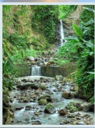
Rivers and Streams, St. Lucia